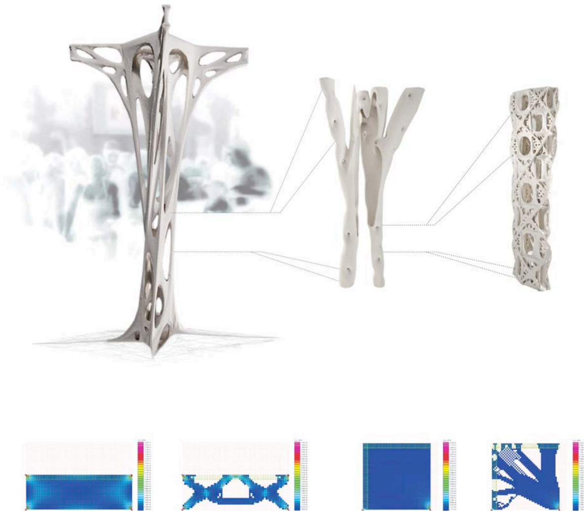
Picture 2: Evolutionary Plasticity – concept models and example diagrams illustrating the removal of low stress regions using Evolutionary Structural Optimization (Xie & Steven)

Genome jewelry, the plaster models pictured have been directly fabricated from a virtual 3D model using the Z-Corp Spectrum, a typical SFF system. The Z-Corp system also supports a proprietary starch material engineered for the investment casting process. It is expected that subdividing the final object will enable a full-scale pattern to be produced via this method. This pattern could then be used as the investment for casting a “fully 3D” building scale component