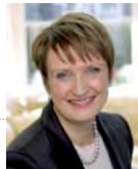
Tessa Jowell Olympics Minister