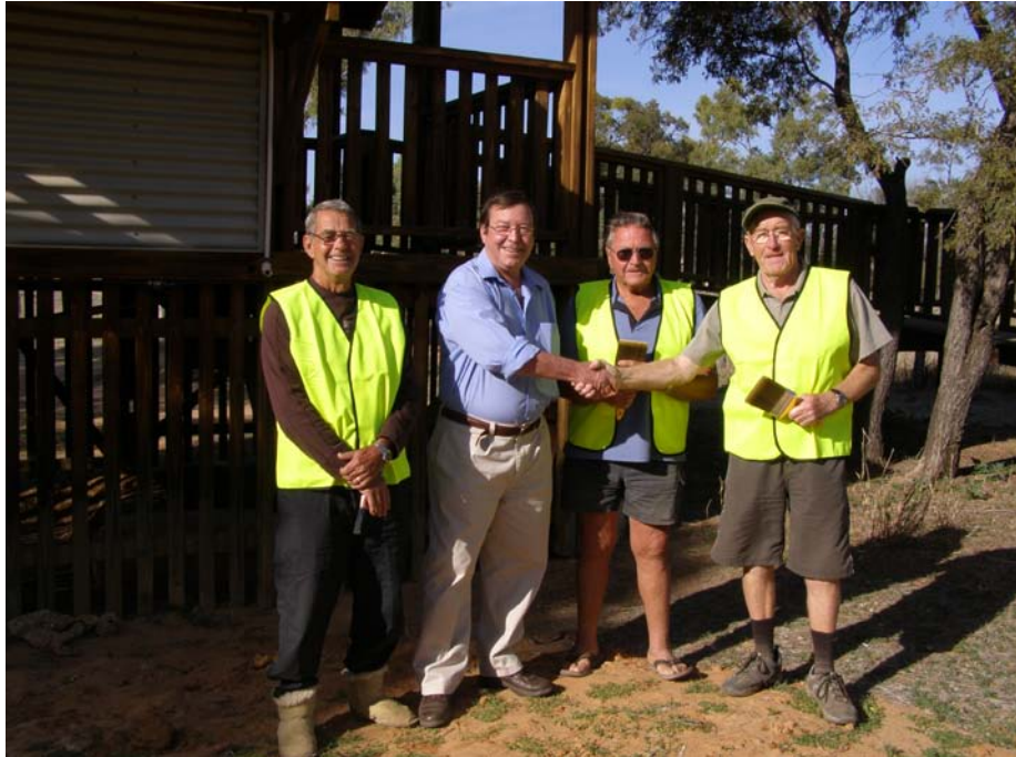
Grey Nomad volunteers paint the toilet block at The Weir, Barcaldine (Stewart, 2009 Media release #2)

The project was successful in demonstrating that Grey Nomads can be valued volunteers for rural towns and the program was well advanced in Barcaldine. It is worth taking time, however to reflect on both the successes and the obstacles to such programs.