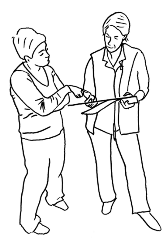
Figure 2: A mother (left) and nurse (right) refer to a child behaviour chart