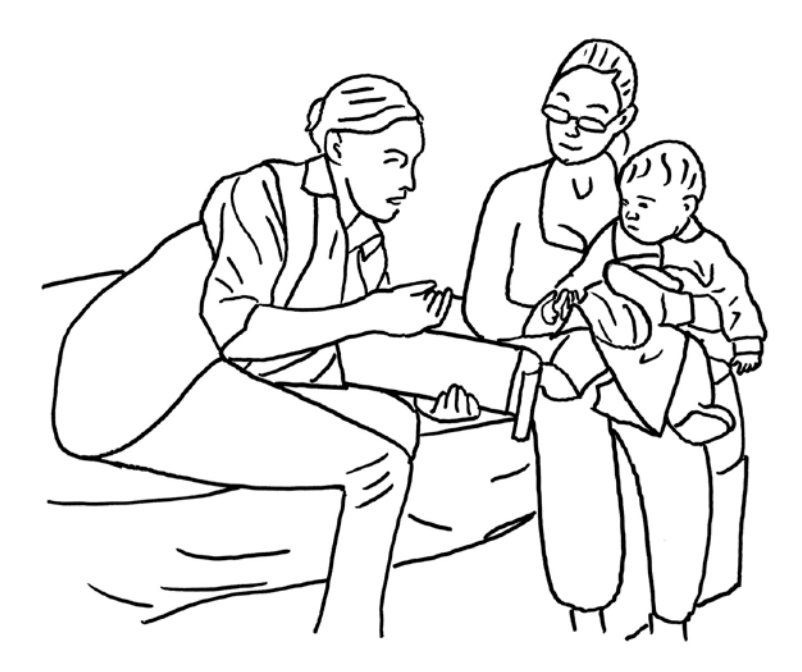
Figure 3: A nurse left) sits on a bed with a mother and child