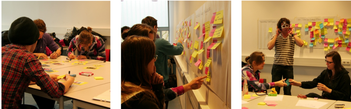
Figure 3: remembering and imagining (a), targeting (b) and envisioning (c) in practicing the Envisioning Use workshop in the course.

The workshop was developed in collaboration with designers in practice in multiple iterations of execution and evaluation. The reactions of participants were generally very positive. However, until now we could not evaluate the impact of the workshop on a complete design process. The work of students in the course ‘design for dynamic use’ will be used to achieve this goal. An additional research objective is to explore the format of the frame of reference to take into the design process.