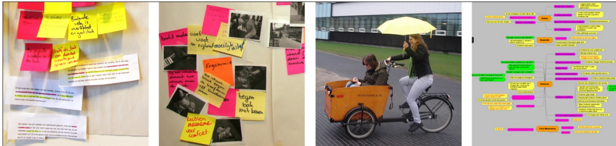
Figure 4: adding quotes (a) and pictures (b) of 'online stories' to the frame of reference, role-play with the carrier bike (c) and part of a mind map of the frame of reference (d)

Four groups of five students participated in the course. The Envisioning Use workshop was taught by executing the workshop with students on a fictional case (a compact camera, see figure 3). They then had to apply it to the carrier bike. An important difference between the fictive case and this case is students did have experience with the compact camera, but did not have personal experience with carrier bikes. Therefore they needed other input for the workshop. They were encouraged to gather stories of use of carrier bikes online before the workshop.