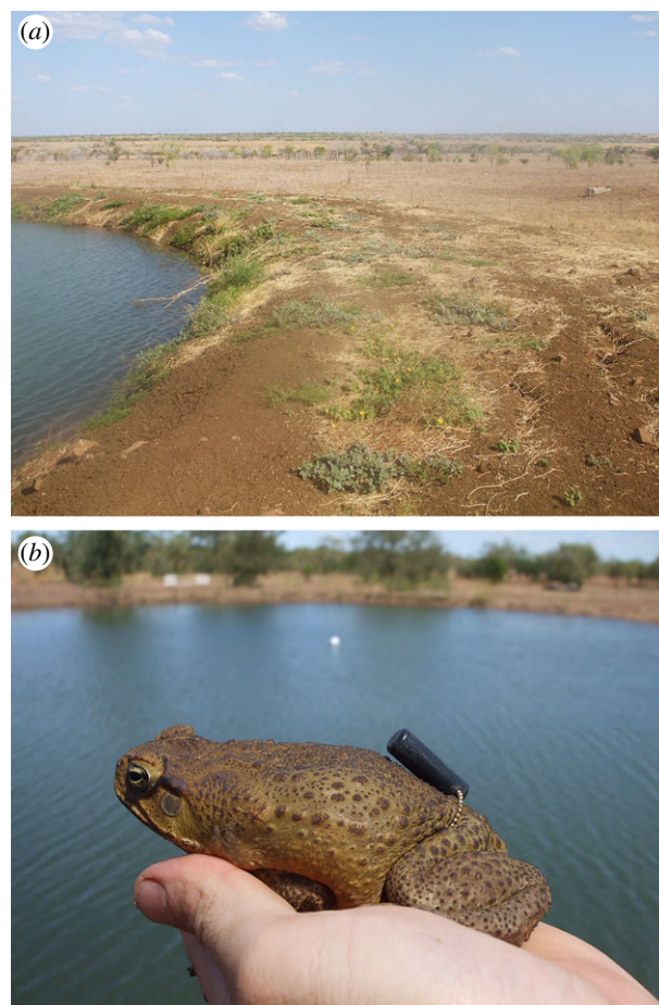
Figure 1. (a) Study site with a bore-filled reservoir in the foreground. (b) An adult cane toad fitted with an acoustic tag.

Once a toad left the water, the signal was lost. We defined a visit as a period of detection that commenced when a toad was first detected in the water and finished when no signal was detected thereafter for 30 min. In this way, we determined the timing, number and duration of visits to reservoirs by cane toads. We obtained 140 422 data points for 20 individual toads monitored continuously during the early dry season (23 April 2010–20 May 2010), and a further 100 369 data points for six of these toads (four males and two females) which were still alive during the late dry season (16 August 2010–17 September 2010). Air temperatures during these two periods ranged from 13.0 to 31.7°C and 12.9 to 35.8°C at night, and 12.8 to 37.1°C and 13.6 to 40.0°C by day, respectively.