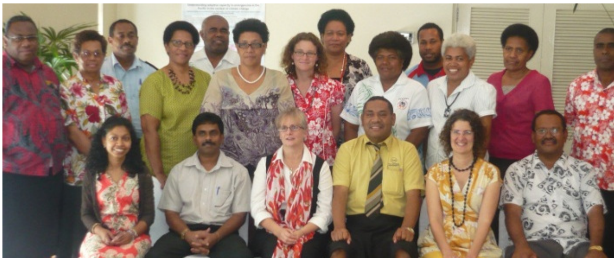
UTS researchers and workshop participants in Fiji.