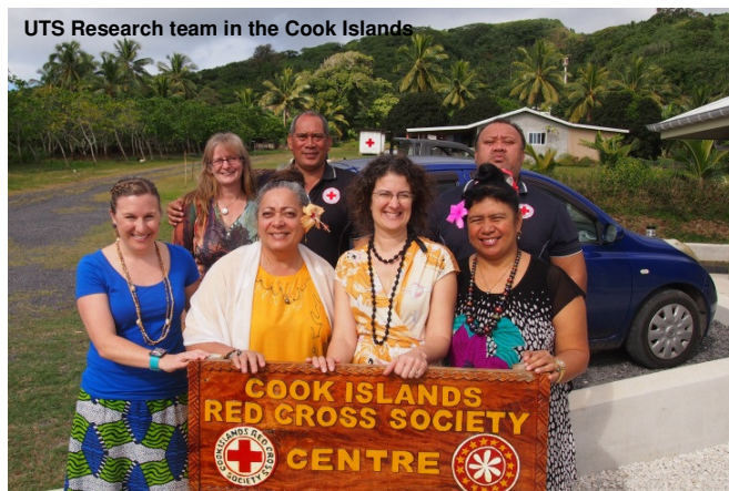
UTS Research team in the Cook Islands