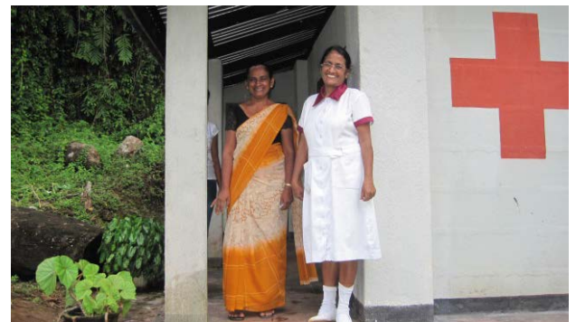
Midwife and teacher at Tea Estate in Matugama.