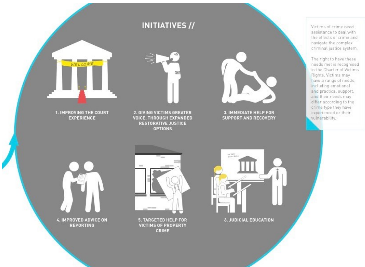
Figure 3 – Core solution directions – Excerpt from report to Department

This data was then compiled into a report which will, by the time of publication, be publicly available. Figure 3 is an excerpt from this report.