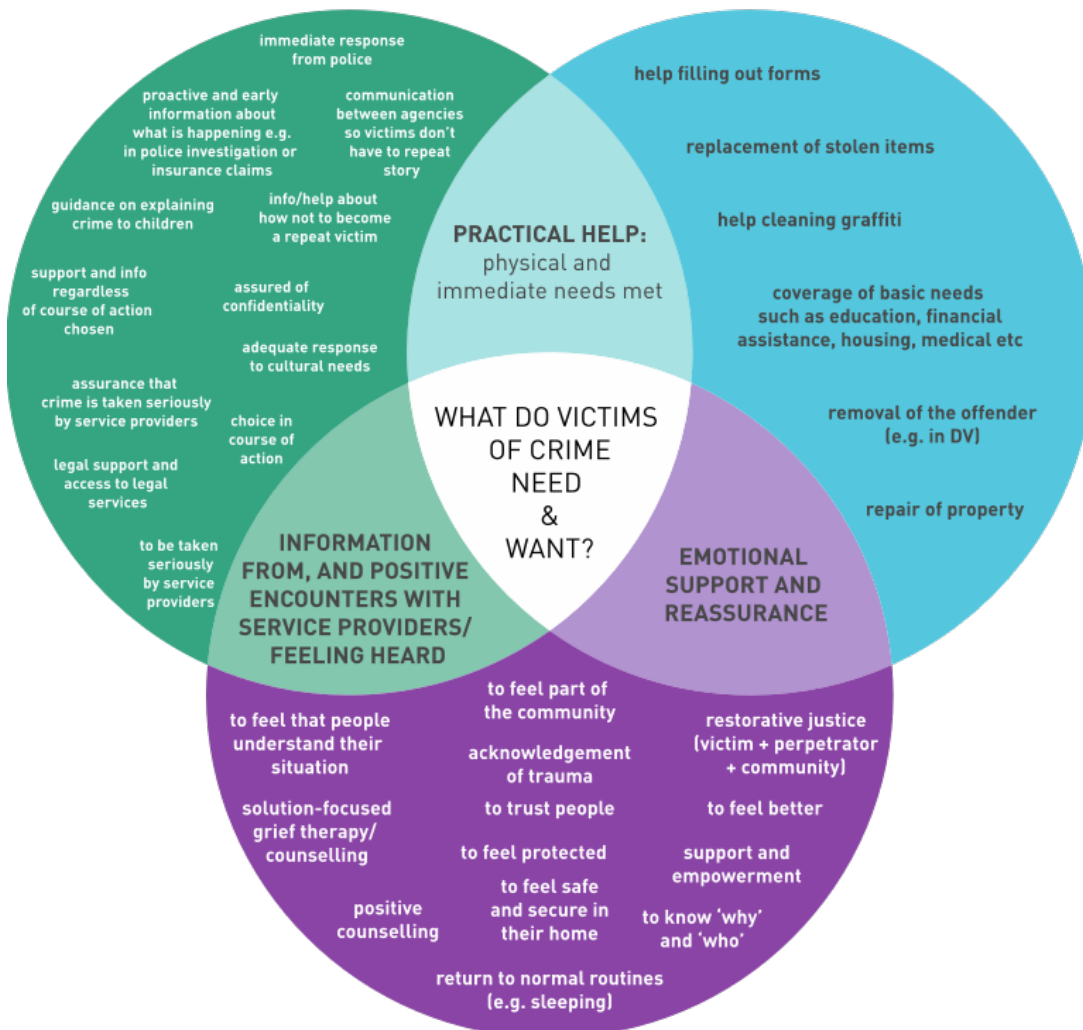
Figure 1 – What are victims' needs? (Results of workshop Exercise 1)