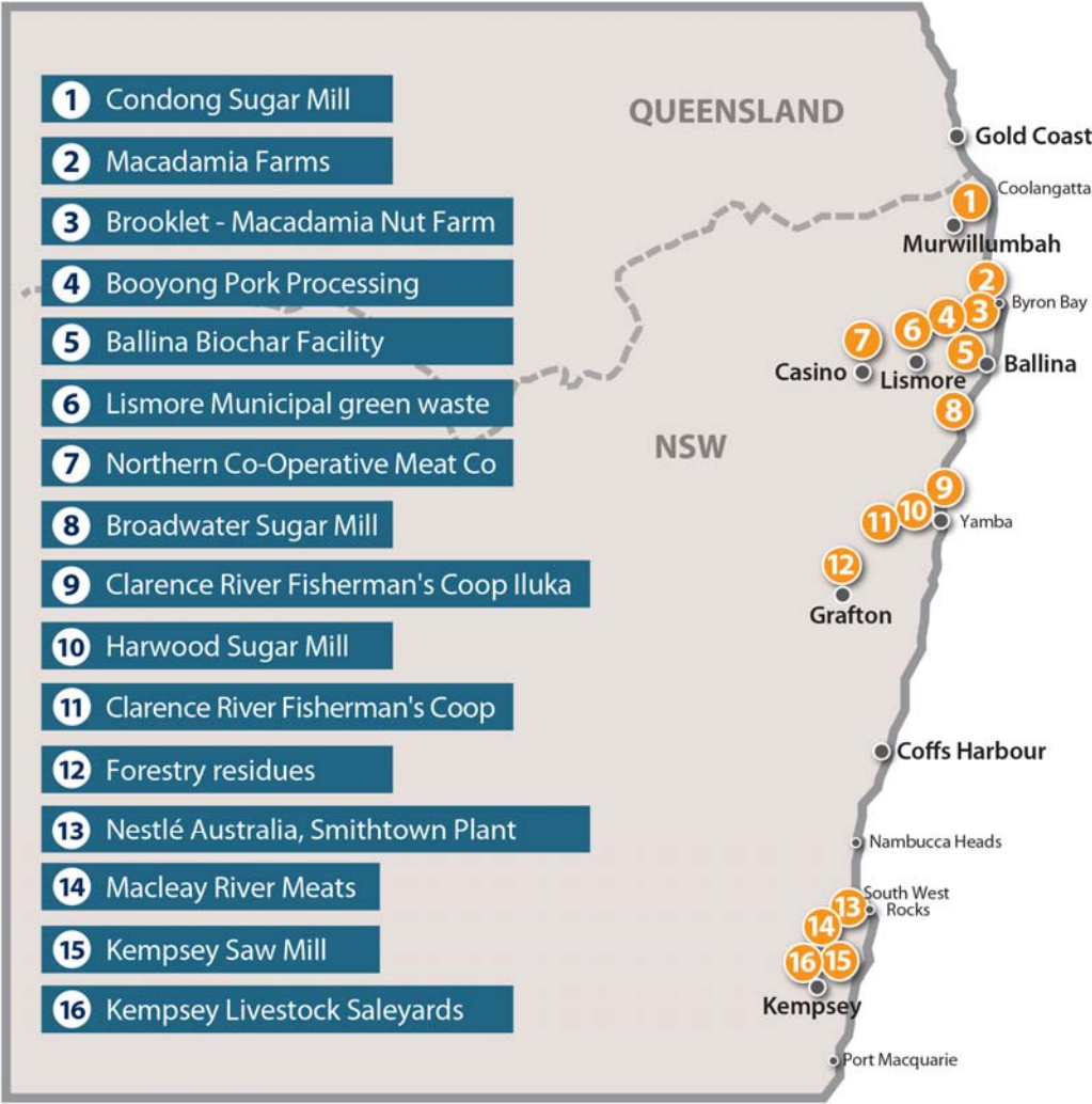
Figure 1: Existing bioenergy activities and potential future feedstocks

Table 1 (over) provides details on current and emerging activities, including location, size and feedstock type.