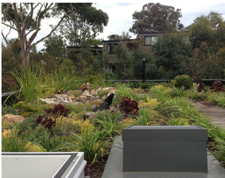
9 10 Plate 1 Foss Street Sydney - extensive green roof

31