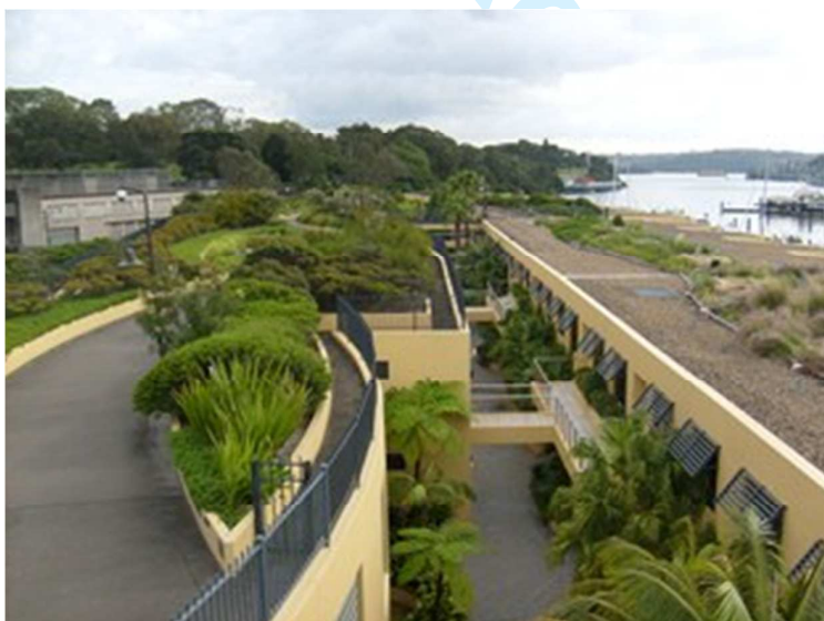
32 33 Plate 2 Wharf Terrace Woolloomooloo Sydney - intensive green roof

53