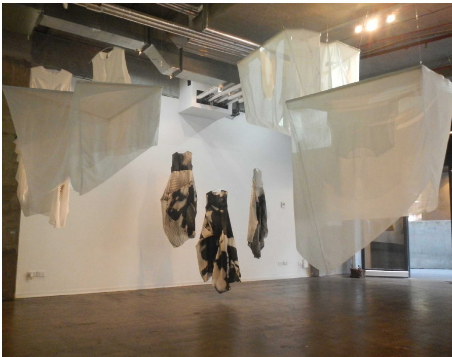
Exhibition instillation, details.