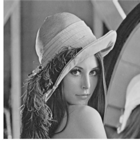
Fig. 3: Lena image

edges. CV can tell the whether the image is clear or fuzzy, the bigger number indicates the good quality. First we use a 3 \times 3 Laplacian window to extract the edges. Then count the pixels of edges, sum up the absolute value of the pixels and see the results.