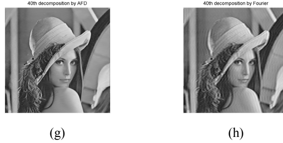
Fig. 4: Image decomposition by AFD (a)(c)(e)(g) and Fourier(b)(d)(f)(h)

Four experiments are conducted in this paper. The results are illustrated in Fig. 4, Table 1 and Table 2. The classical ‘Lena’ (see Fig. 3) with size 512 \times 512 , 8 \times 8 bits/pixel is used. In Fig. 4, the left side column is the reconstruction result by AFD, with 10 th , 20 th , 30 th and 40 th decomposition level. The corresponding results by using Fourier decomposition are shown in the right side column. We can see that at the same level, AFD based result appears more clearly than Fourier does. Through the objective outcomes in Table 1 and 2, for AFD, the MSE is lower than Fourier, the PSNR and CV is higher than Fourier. The overall experiment results indicate that AFD converges faster in image decomposition, which provides potential applications for image compression in the future.