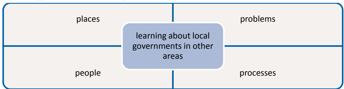
Figure 9: Triggers for an interest in learning about other councils

While respondents were encouraged to share insights into how information derived from other councils is taken further within their own councils, it was difficult when using the methodology of the current study to ascertain how this 'looked' in a concrete sense, and may require the use of observation or participant observation methods in future studies. This is in keeping with findings from the academic literature that knowledge dissemination strategies need to pay more attention to the recipient organisation and its capacity to apply learning, and that research should not focus exclusively on the provider of learning (Downe, Hartley & Rashman 2004).