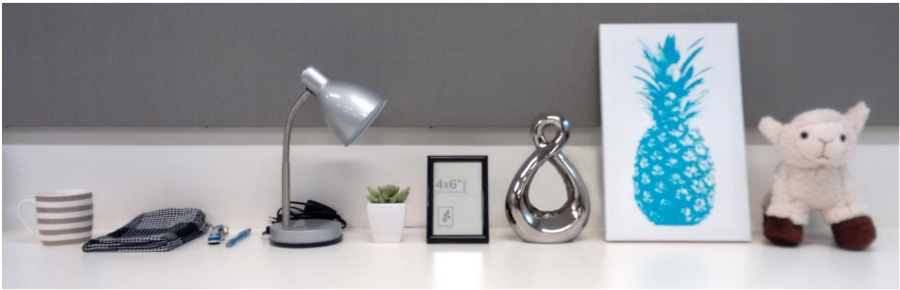
Figure 1. From left to right, five ‘active’ objects: mug, tea towel, key ring, pen, lamp and five ‘contemplative’ objects: plant, photo frame, sculpture, visual art and plush toy.

children's first time reactions to the expressive behaviour of the robotic pet, AIBO. In her paper, Lacey (2009) presents a range of emotive ceramic cup and saucer designs that play on the ideas of engagement and empathy within the user experience. Van Krieken et al. (2012) propose a 'sneaky kettle' that reveals signs of animacy and personality by rotating when nobody is looking. They propose a number of product qualities for promoting emotional durability including 'adapt to the user's identity', acknowledging the importance of self-expression and group affiliation in the formation of emotional attachment (Kleine et al., 1995; Schultz et al., 1989; Wallendorf & Arnould, 1988).