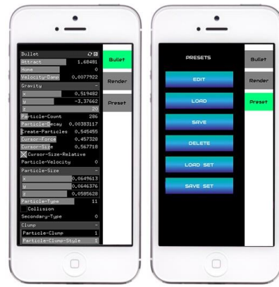
Figure 2. The ioStorm auto-generated layout for the Creature installation, displaying both low-level parameter control (left) and high-level preset control (right)

With Creature , there were no designated performers or choreographed movements to build the interactive states around. Building this type of interaction suggested an iterative trial and error approach where neither graphics, interaction or