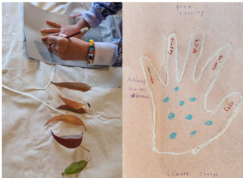
FIGURE 3. Orienting exercise: positive and negative thoughts and feelings in and about nature.

(and their carers) to share only what felt real and relevant to them.