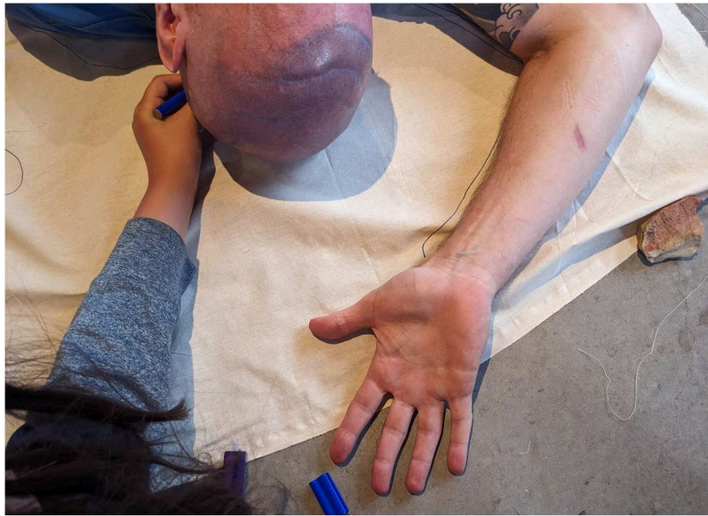
FIGURE 4. A daughter tracing her father's outline.

Participants engaged with the materials we offered them both deliberately and intuitively. Sometimes they considered the symbolic or literal qualities of an object and how it would generate meaning in their map, at other times they simply selected an object because of its aesthetic or material appeal, with its meanings emerging later, as the participant reflected on their map as a whole. Participants were asked to purposefully consider where and how the materials were arranged on their body maps, in order to best express their feelings and experiences. As one participant reflected: '[I'm thinking about] where they can fit in and ... about what they feel like and what they might represent to me'.