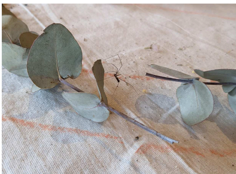
FIGURE 9. Visiting Daddy Longlegs. One of many more-than-human visitors.

calico already marked up with the bodies of a family; the ephemeral wetland on the cusp of our gathering point, home to an endangered ecological community of Eastern Suburbs Banksia Scrub, many of whose species have a symbiotic relationship with soil micro-organisms living in their roots. How did they feel, hosting our human conversations without permission?