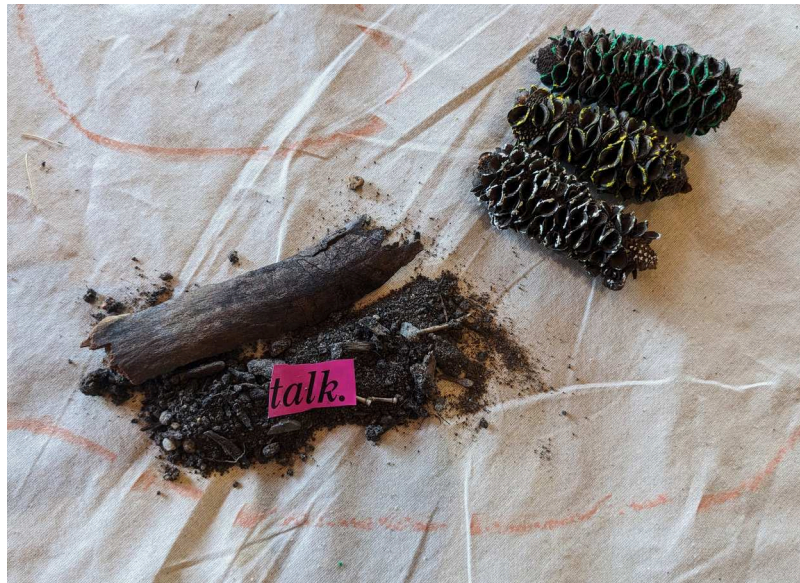
FIGURE 7. Bark holds words that ‘humans can’t understand ...’.

The young people taking part took seriously our request to consider and share their feelings and responded earnestly and openly. Unlike previous workshops we have facilitated (on other topics), children did not appear awkward or uncomfortable when invited to talk about their emotions. We speculate this was because the presence of caregivers and siblings offered a sense of safety and comfort. Children’s feelings about their environment revealed their awareness of both local and global concerns connected to the Anthropocene and our changing climate. They told us (with words, drawing, and collage) that they worried about rubbish and waste, cut-down trees, animal homes [being] broken (Figure 3), climate change, natural disasters, pollution, palm oil, floods, bushfires, deforestation, petrol, coal, gas, over-fishing, loss of habitat, carbon dioxide, buildings, plastic bottles in the ocean, and cars. Sometimes these comments surprised both us, and their carers: for example, a mother told us she had no idea her son worried about palm oil. Carers worried about many of the same things articulated by young people and felt anxiety about their children’s futures in an uncertain and changing world. For example, the little boy’s mother used bark in her body too, at the place approximating her head, which was tucked in below her arms. She had