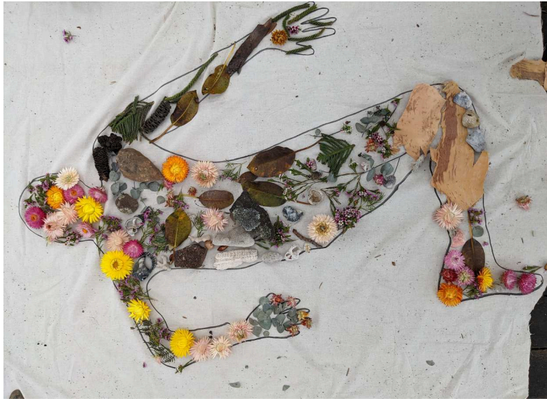
FIGURE 2. A body map adorned with natural materials.

scaffold for the exploration of complex experiences and feelings that emerge from our connections to wonderful, but often wounded, places.