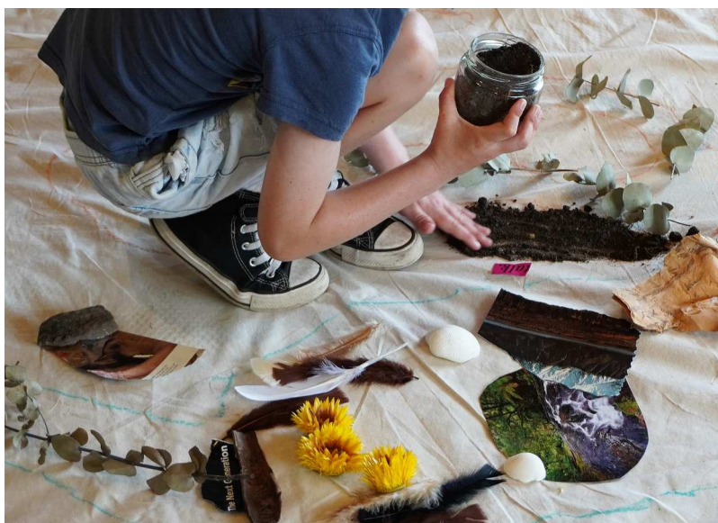
FIGURE 5. A young boy spreading earth on his body map.

Participants did not use glue or tape when creating their maps, they simply placed materials on to the calico (an act that felt particularly ephemeral when a large gust of wind blew through the workshop space, dispersing our collages and sending us scuttling to reconstruct them). At the close of the workshop, we dismantled the maps, sorting natural and collage materials into loose typologies and storing them for another day. We folded calico sheets, making plans to wash and reuse them. In the end all that remained were traces: a scattering of dirt on the floor, the distinct waft of eucalyptus, photos on an SD card, and our memories of thoughts voiced, and ideas shared. Later, we would return the lichen-covered stones to their home in the bush: remembering Tyson