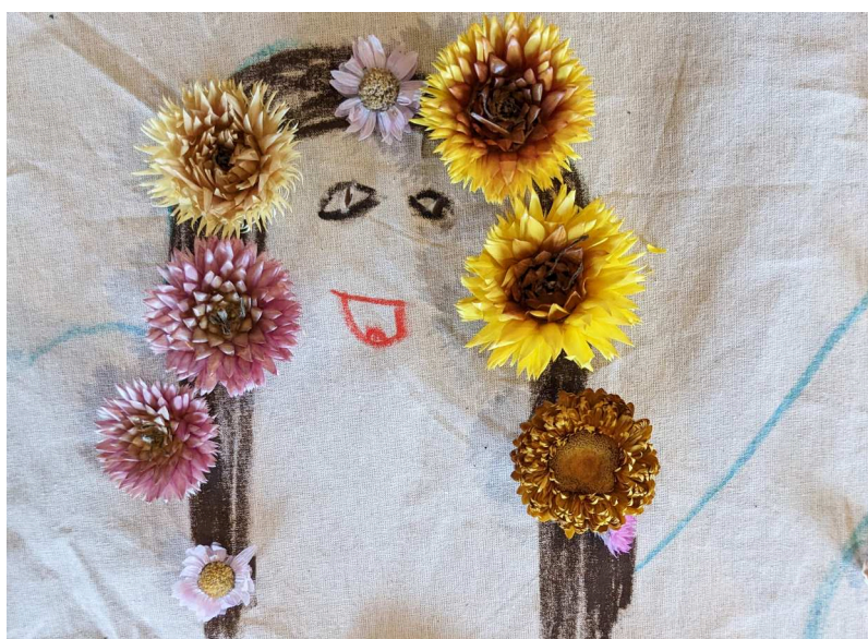
FIGURE 8. A joyous feeling captured by a young body mapper.

Which brings us to the more-than-human participants (Adams 2020; Tsing et al. 2021; Wright 2016) in this project: the Daddy-long-legs Spider ( Pholcus phalangioides ) who found their way into the silver dollar gum leaves ( Eucalyptus cinerea ) someone had placed along a limb (Figure 9); the Magpie ( Gymnorhina tibicen ) who entered the classroom for a few minutes, walking inquisitively across a piece of